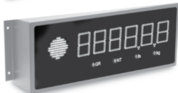
LaserLight 4 in digit with stop and go lights