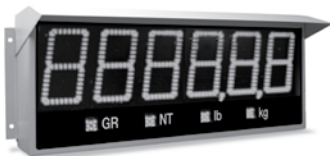
LaserLight 6 in digit shown with visor