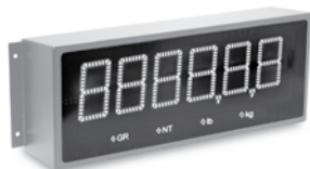
LaserLight 4 in digit