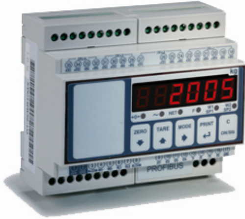
Digital weight transmitter/indicator, ideal as junction box.